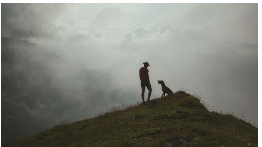
The golden autumn not only brings the most beautiful hiking season, but also the hunting season begins and with it for me the most beautiful season on the Arlberg: Nature in radiant colors, warm, golden light, clear air and wide views.

"Nothing ventured is nothing gained" perhaps it is precisely the confrontation with the unknown, that allows us to surpass ourselves. Can we still dare to live life with an open mind, to experience the real adventure?